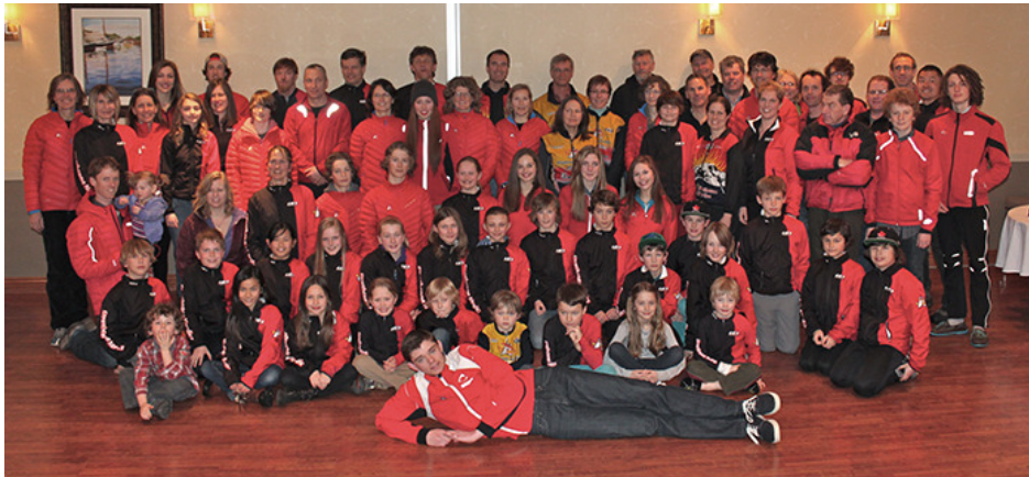
SIXTY STRATHCONA NORDICS racers plus coaches and support crew enjoyed racing and camaraderie at the BC Champs in Kelowna last weekend.