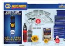
NAPA Auto Parts Expires this Monday