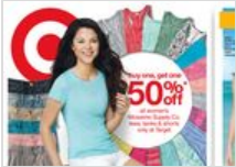
Target Canada Preview the Deals