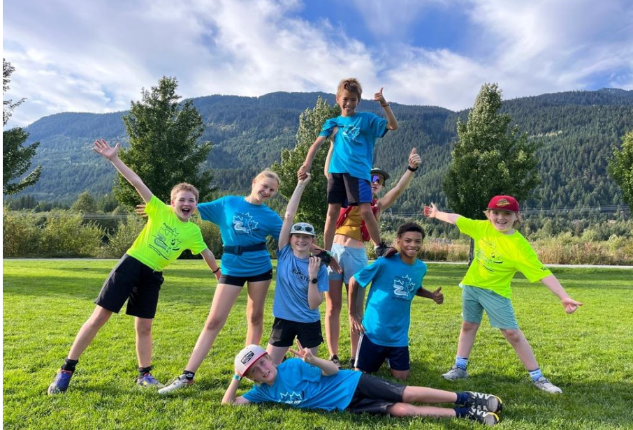
After another delicious meal by Whistler Cooks athletes went to bed with tired legs and full hearts!

On Sunday morning the athletes had three options for the morning long run/hike sessions: a trip to Loggers Lake, an out and back on the Helm Creek trail or they could choose the Rubble Creek- Helm Creek Traverse. Once choices were made the athletes set out for an up to fourhour adventure of running and hiking. By lunch on Sunday everybody was tired and ready for