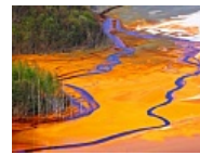
These are the most toxic places on earth. You'll never believe #5!