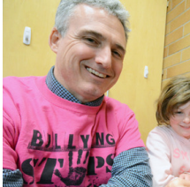
Pinkies painted pink