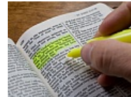
Ancient New Testament passage aligns with modern cure for our deadliest disease [VIDEO]