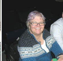
Toastmasters creates leaders