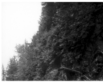
A place name mystery: Howser, Hauser, Houser, or Hawser?