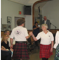
Celebrating Robbie Burns