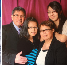
Program improves life after stroke