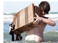
You won't believe what this airline did with his luggage!