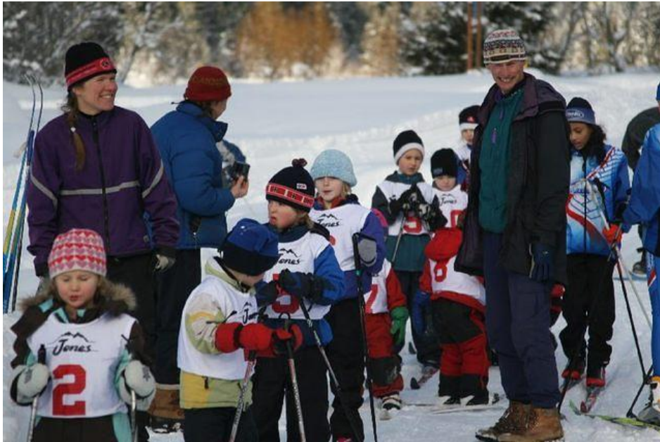
The Teck Kootenay Cup Race promises good times for the whole family on March 1.