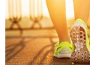
These tips will keep you motivated and help you achieve your weight loss goals!