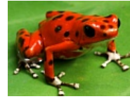
Very cute animals that can kill you!