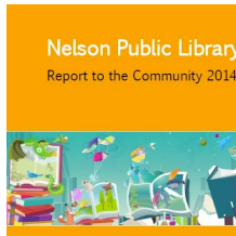
COLUMN: Getting the buzz at the Nelson library